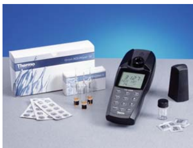
Versatile AQ4000 Meter

The AQ4000 colorimeter stores up to 189 pre-programmed methods and can record 100 data points in the field with a time and date stamp. Download later to a printer or computer in the lab.